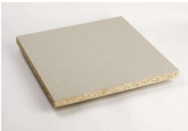
Figure 3: Fimaplast/Superpan Decor