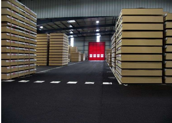
Figure 1: Finished product in Stock