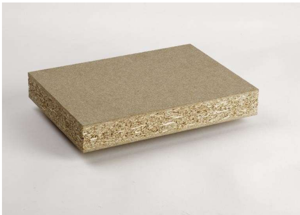
Figure 2: Fimapan/Superpan